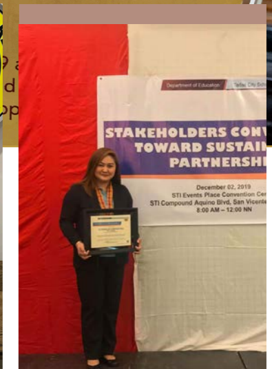
DepEd gives recognition to PSC's Education and Health Programs