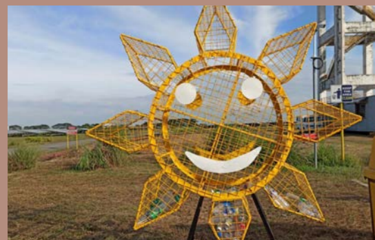
PSC's San-San, a beautifully-made waste container, serves as drop-off container for plastic wastes to be used in the Ecobrick Project